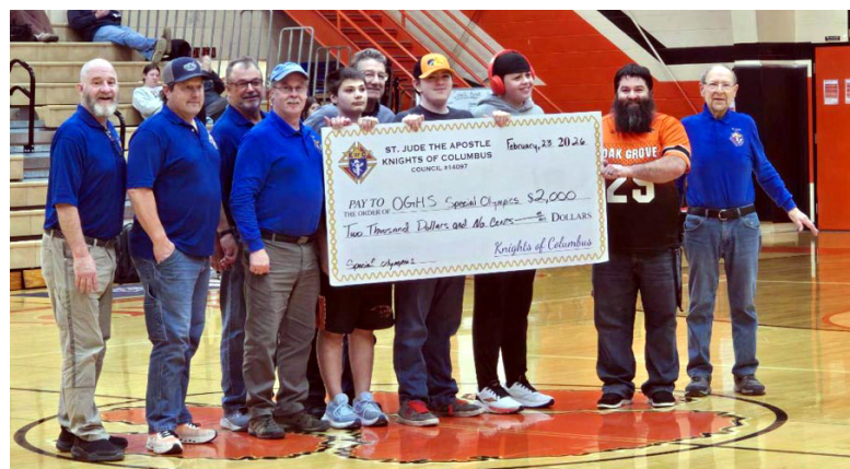
St. Jude The Apostle #14097 Oak Grove recently presented OGH'S Special Olympics a donation of $2,000.00 to support their program.

Charles Leanu reports blood drives are going very well this year with more Councils reporting their participation. If you have participated in a blood drive or your Council held their own event, please report to Brother Charles, through the website form or email or IM or a phone call of your Councils holding of or participation in blood drives. Lastly, we are still accepting your donations to the Agape house/ prison concern program. Donations have been down a little this year. I challenged the district deputies to urge their Councils to, at least, match the participation rate of the Ladies' Auxiliaries. Thank you, ladies, for what you do. Questions on these programs contact Charles Leanu, Cmalenau12@spectrum.net