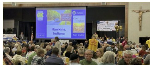
St. Joseph's 31st Annual Trivia Night - Just look at the attendance