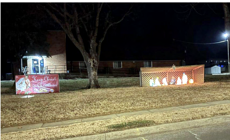
A meaningful and annual tradition outside the Fr. Hager Council Hall is to remind all of the true meaning of Christmas.

Remember They Will Not Join Unless They Are Asked!