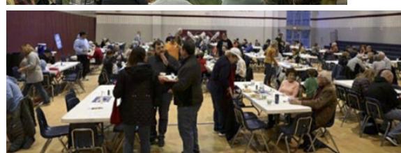
Right: The Fish Fry Crew in the newly constructed Fry Mansion