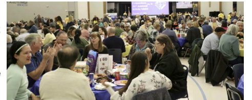
Left: St. Alban Roe - First Fish Fry using the School and gym.